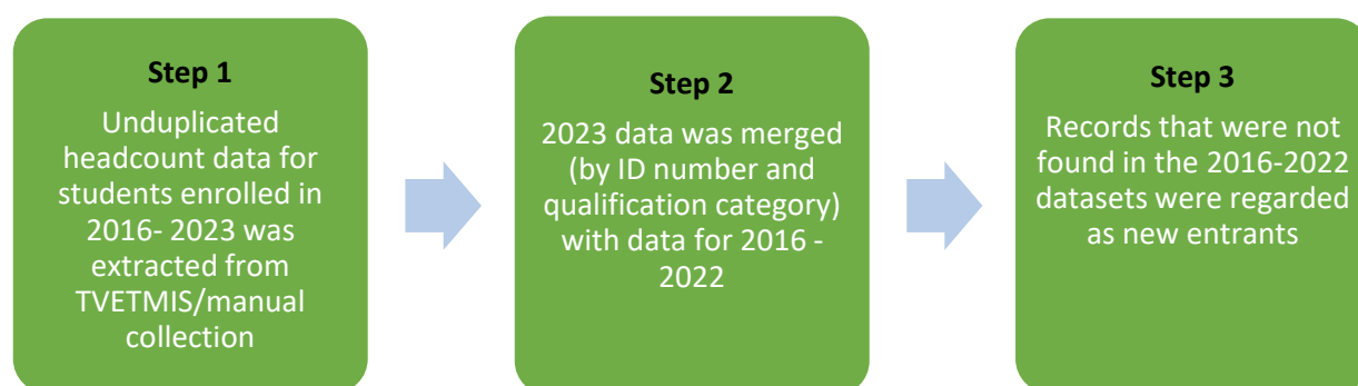
Figure 1: Step by step methodology for calculating 2023 new entrants in TVET colleges

A one-to-one relationship by ID number and qualification category was used to identify new entrants in a qualification. A step-by-step explanation of the methodology is provided in Figure 1 below: